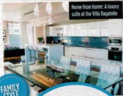
Home from home: A luxury suite at the Villa Bagatelle