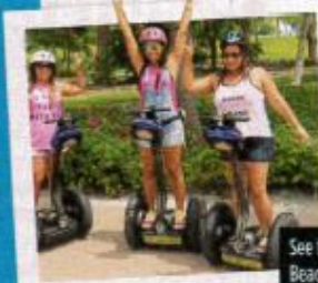
See the sights of South Beach by Segway

South Beach has 30 blocks of art deco buildings and you can whizz past the famous landmarks on a Bike and Roll Segway Tour Ride. It's a fun way to see Ocean Drive, the Versace mansion and the Botanical Garden; from £38, bikemiami.com. Or sip around the city on a guided art deco-themed cocktail tour. Quaff mojitos and margaritas over two hours; £40, miami culinarytours.com. Or go on an Art and Bar Crawl with Urban Adventures, £19; urbanadventures.com