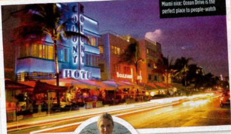
Miami nice: Ocean Drive is the perfect place to people-watch

From speedboat rides to swimming with stingrays, Florida's southern city is jam-packed with adventures