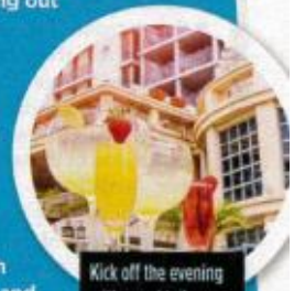
Kick off the evening with a cocktail

Variety is the spice of life, and when it comes to eating out in Miami, that's certainly true! Start the day in style with breakfast at the News Cafe on Ocean Drive. It's a must for big American portions of fresh fruit, omelettes and pancakes, while watching the rollerbladers speed by; newscafe.com . For a more tranquil setting, try the Peacock Garden Cafe in Coconut Grove. Make sure you sample the cakes washed down with homemade lemonade; peacockspot.com . Splashing out? Open-roofed Asian restaurant Bāoli is ideal for a special occasion. Eat sushi and sashimi rolls under the stars; from £11, lebaoli.com/baoli