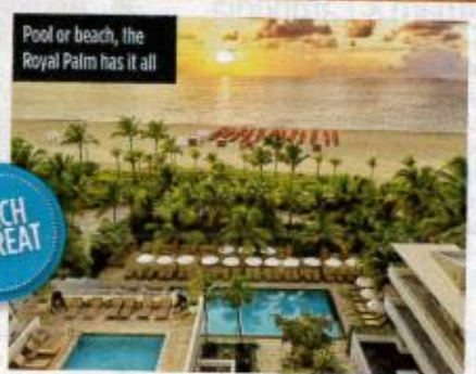
Pool or beach, the Royal Palm has it all

Locals will tell you the best view of Miami is from the water, and a Zodiac RIB ride by Ocean Force Adventures is a good place to start. You'll zip around the bay to see the multi-million dollar celebrity mansions of Star Island – a favourite haunt during the 1950s of Frank Sinatra – and also the last remaining stilt houses built over water; prices from £100 per group, oceanforceadventures.com . If something more relaxed is your thing, try a Sunset Cocktail cruise with sailo.com . Round off the day watching the million-dollar yachts sail by on the North River Drive, as you tuck into a king crab cocktail at renowned restaurant Sea Spice; seaspicemiami.com .