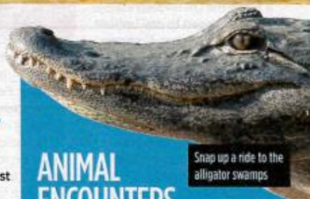
Snap up a ride to the alligator swamps

Head an hour south of Miami to the Everglades Alligator Farm, where you can zip through the swamps on an airboat ride. It is home to about 2,000 alligators of all sizes, so you're sure to spot these incredible creatures; everglades.com. The Sea Trek Reef Encounter at Miami Seaquarium is no ordinary marine museum. Here you can swim with stingrays, tropical fish and unique sea creatures in a 300,000 gallon tropical reef, all while wearing a state-of-the-art dive helmet that allows you to breath normally under water. Prices start at £69, miamiseaquarium.com