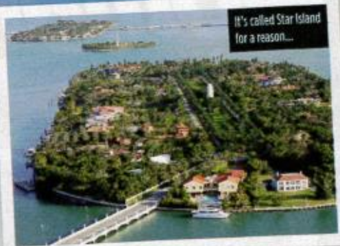
It's called Star Island for a reason...